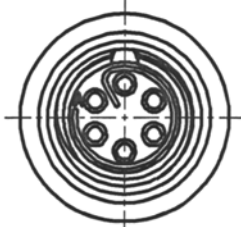
REAR FACE VIEW SCE 6 WAY