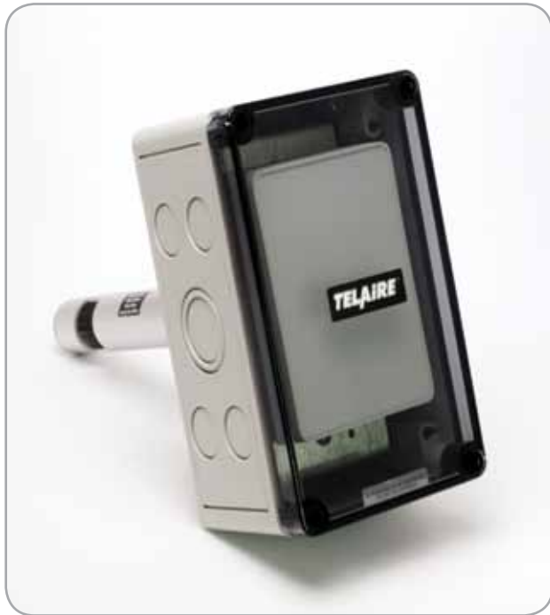
T1508 Aspiration Box for Duct Mounting

The Model 1508 is designed for in-duct sampling of CO 2 concentrations at flow rates greater than 400 fpm. Clear cover allows for observation of the sensor. They will accommodate any of the Ventostat 8100 or 8200 series, and can be used for temperature and RH when fitted. Enclosure is screwed to the duct with probe inserted into air stream. Air sampling probe is 1-inch (25.4mm) diameter and 8-inch (203.2mm) long. Enclosure (ABS plastic) has knockouts for conduit connection. Note: Wiring penetrations must be sealed prior to use. CO 2 sensor not included.