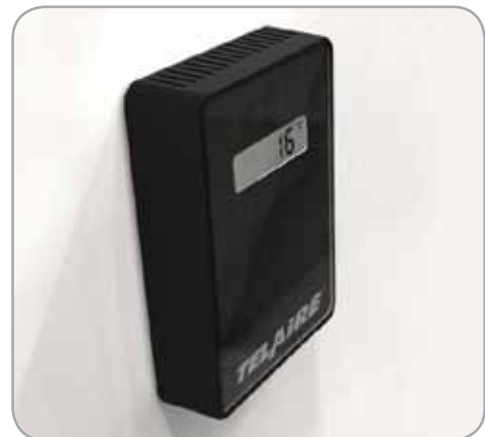
Black versions are for applications such as movie theaters