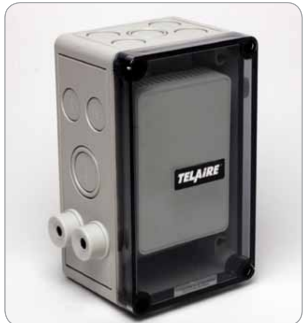
T1505 Splash Resistant Enclosure and T1552 Outside Air Enclosure

The Model 1552 is a rugged weatherproof enclosure (ABS plastic), designed to allow the 8000 series sensor to operate in an outdoor environment and/or where ambient temperatures are below freezing. The 1552 is ideal for monitoring outside air or CO 2 as a surrogate for combustion fumes in parking garages, tunnels and loading docks. This enclosure features a temperature control circuit and internal heaters to maintain the sensor within its normal operating temperature range, even if temperatures outside the enclosure are as low as -20°F (-29°C). Four diffusion ports allow for entry of CO 2 . Response time of the sensor is slowed to approximately 30 minutes to measure a 90% step change in concentrations. Enclosure is designed to screw directly to a wall. CO 2 sensor not included. Power consumption is 24V, 1.5 Amp (max), and includes the Ventostat 8000 series.