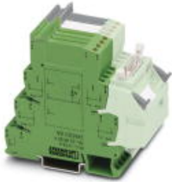
VARIOFACE feed-through terminal block (2-wire connection), for PLC-RELAY universal series, with light indicator 24 V DC

Please be informed that the data shown in this PDF Document is generated from our Online Catalog. Please find the complete data in the user's documentation. Our General Terms of Use for Downloads are valid ( http://phoenixcontact.com/download )