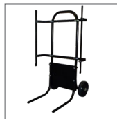
AC6000-MNT-00 Mounting Frame Optional for mounting ISB to a cart or other surface. Included with the AC6000-CART-00.