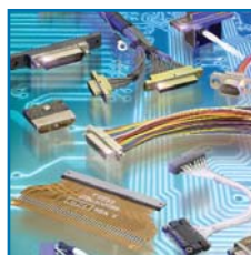
Microdot Connectors and Cables