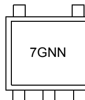
5-Lead Chip Scale