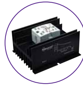
Heat Sink (SSR-HS-1) Section 3 p.20