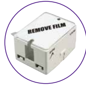
Optional Thermal Pad (SSR-TP-1) Section 3 p.21

We at Magnecraft strive to be your one-stop-shop for all of your solid state relay needs. The new line of 6 series solid-state relays give industrial relay users an energy-efficient current switching alternative. Depending on the application, these solid-state relays offer a number of advantages over electromechanical relays, including longer life cycles, less energy consumption and reduced maintenance costs. This is why great care and attention was given when developing the next generation of "Hockey Puck" style SSRs. These new SSRs will be finger-safe, fit a pre-cut heat transfer thermal pad (sold separately) and have the ability to be mounted onto a factory tested pre-drilled and tapped heat sink (sold separately).