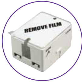
Thermal Pad (SSR-TP-1) Section 3 p.21