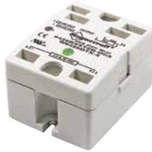
Blade Terminals DPST-NO