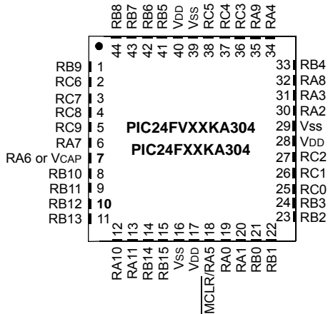
44-Pin TQFP/QFN (1,3)

Legend: Pin numbers in bold indicate pin function differences between PIC24FV and PIC24F devices.