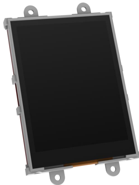
The uLCD-28-PTU Display Module