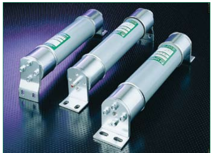
Bolt-in Mount Fuses