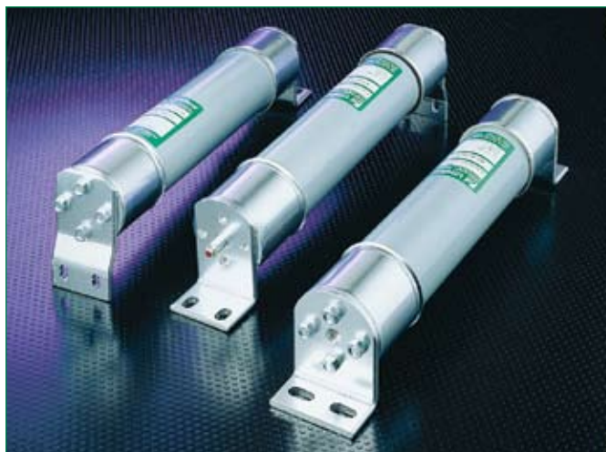
Bolt-in Mount Fuses