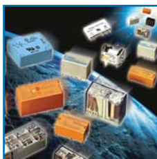
Schrack PCB Relays