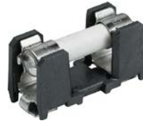
OGN-SMD equipped with fuse