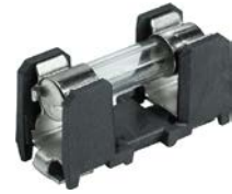
OGN-SMD equipped with fuse

500 VAC · 4 W/16 A (VDE) · 500 V · 16 A (UL/CSA)