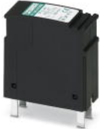
Protective plug PT with HF protective circuit for 4 signal wires. Nominal voltage: 5 V DC

Please be informed that the data shown in this PDF Document is generated from our Online Catalog. Please find the complete data in the user's documentation. Our General Terms of Use for Downloads are valid ( http://download.phoenixcontact.com )