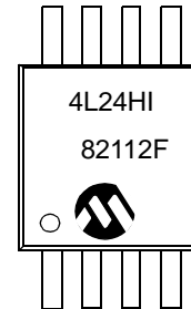
8-Lead 2x3 TDFN