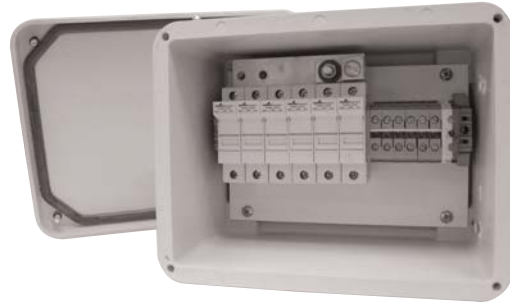
BCBC Series Compact Box