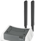
LTE Connectivity Kit