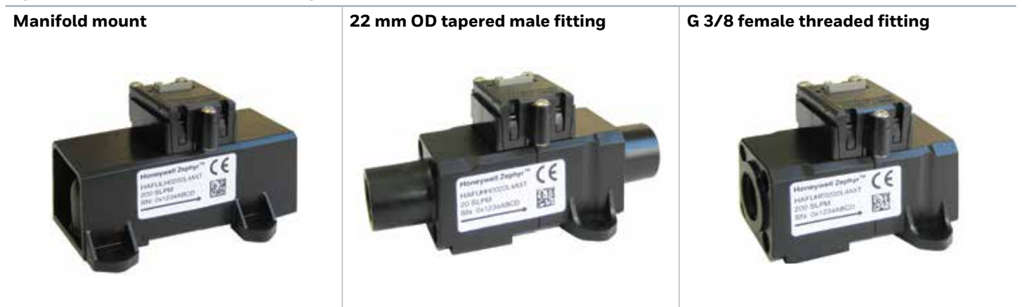
Figure 3. All Available Standard Configurations

1 Apart from the general configuration required, other customer-specific requirements are also possible. Please contact Honeywell.