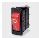
C5503AL - - -