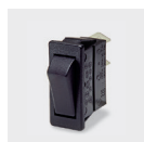
C5500AL - - -