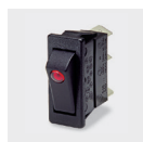
C5503PL - - -