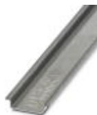
DIN rail, unperforated, Width: 35 mm, Height: 7.5 mm, Length: 2000 mm, Color: silver

DIN rail, unperforated - NS 35/ 7,5 AL UNPERF 2000MM - 0801704