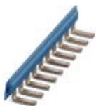
Insertion bridge, Number of positions: 80, Color: blue

Insertion bridge - EB 80- DIK BU - 2715940