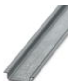
DIN rail, material: Galvanized, unperforated, height 7.5 mm, width 35 mm, length: 2 m

DIN rail - NS 35/ 7,5 ZN UNPERF 2000MM - 1206434