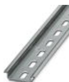
DIN rail, material: Galvanized, perforated, height 7.5 mm, width 35 mm, length: 2 m

DIN rail - NS 35/ 7,5 ZN PERF 2000MM - 1206421