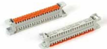
3M™ Quick Connect System (QCS) 2810