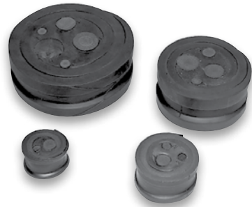
3M™ SLiC™ Spiral End Seals for the 3M™ SLiC™ Aerial Closures and Terminals