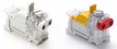
3M™ Termination Module MX2000 Single-Pair Terminal Block