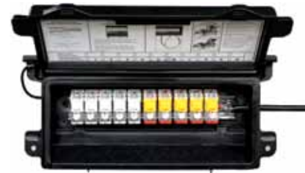
3M™ SLiC™ Stubbed Aerial Terminal with 3M™ Termination Module MX2000 unprotected/protected Terminal Block