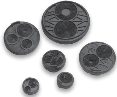
3M™ SLiC™ Rubber End Seals for the 3M™ SLiC™ Aerial Closures and Terminals