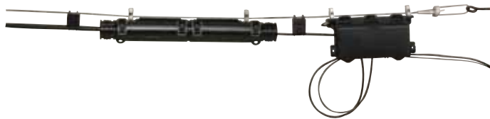
3M™ SLiC™ Stubbed Aerial Terminal with 3M™ SLiC™ Aerial Closure

The stubbed aerial terminals can be installed on the left or right side of an aerial closure, offered with a 12-foot cable tail. The terminal is offered with 10- or 25-pair 3M™ Multi-Pair Terminating System ATS/TR termination block or 10-pair 3M™ Termination Module MX2000 Single-Pair Terminal Block (protected or unprotected). The unprotected version can be upgraded by switching the blocks to protected version in the same terminal if needed.