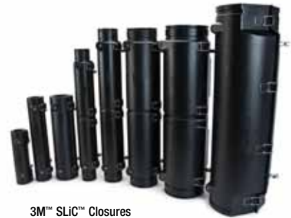
3M™ SLiC™ Closures

For the last 20 years, 3M SLiC closures and terminals have protected aerial networks, globally, in more than 30 different countries.