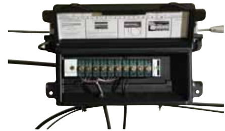
3M™ SLiC™ Stubbed Aerial Terminal with 3M™ Multi-Pair Terminating System ATS/TR termination block