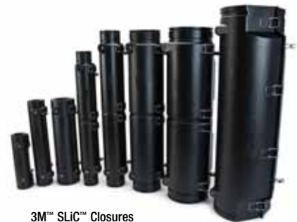
3M™ SLiC™ Closures

For the last 20 years, 3M SLiC closures and terminals have protected aerial networks, globally, in more than 30 different countries.