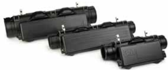
3M™ SLiC™ Terminals 319, 328, 530