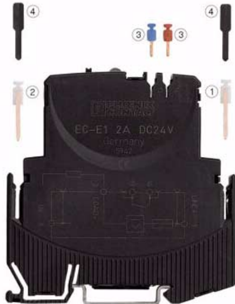
Figure 5 Structure (using example of EC-E1)