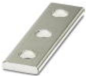
Connection rail, Color: silver