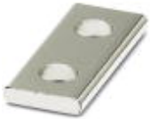
Connection rail, Color: silver