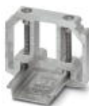
End clamp, for end support of UKH 50 to UKH 240, is pushed onto DIN rail NS 35 and fixed with 2 screws, width: 10 mm, color: aluminum