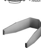
AT109 Cap Extractor

Actuator must be in UP position. Pull off cap with cap extractor AT109. Replace lamp and reassemble as shown above.