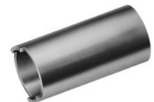
AT112 Socket Wrench