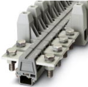
Universal terminal block with bolt connection, cross section: 50 - 150 mm 2 , width: 46 mm, color: gray

Please be informed that the data shown in this PDF Document is generated from our Online Catalog. Please find the complete data in the user's documentation. Our General Terms of Use for Downloads are valid ( http://download.phoenixcontact.com )