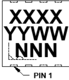
8-Lead DFN (3x3 mm)