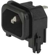
Snap-in version Sandwich/rear-side PCB Mounting