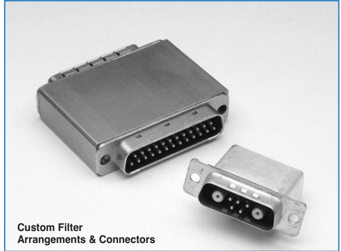
Custom Filter Arrangements & Connectors