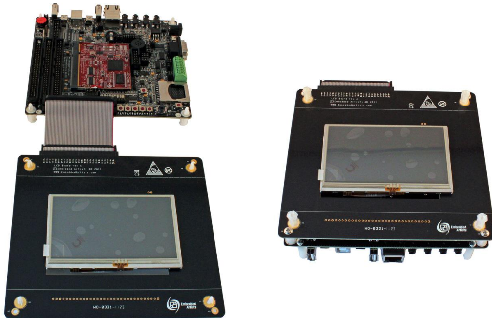
Figure 1 – LCD Board Mounting Options