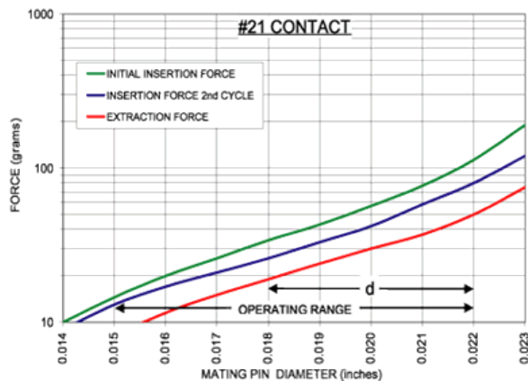
The insertion/extraction/normal force characteristics above were derived using a 30 microinch gold plated contact and polished steel gauge pins having a bullet-shaped tip.

†Since BeCu loses its spring properties over time at high temperatures; it is rated for continuous use up to 150°C. For applications up to 300°C, Mill-Max offers many contacts in Beryllium Nickel. Contact Tech Support for more info.