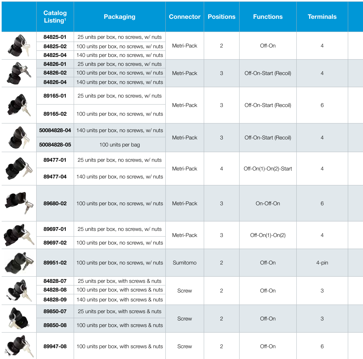
Table 2. Key Switch Order Guide and Specifications