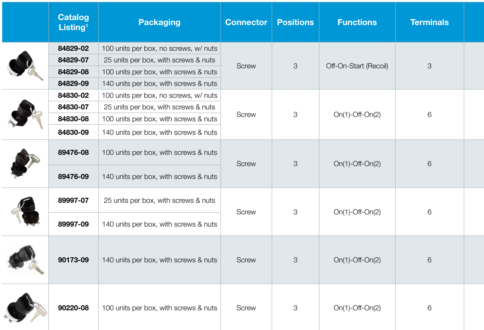
Table 2. Key Switch Order Guide and Specifications, continued

1 Numbers before the dash indicate the model number; numbers following the dash indicate the packaging option. For more information on packaging options, see Table 3.