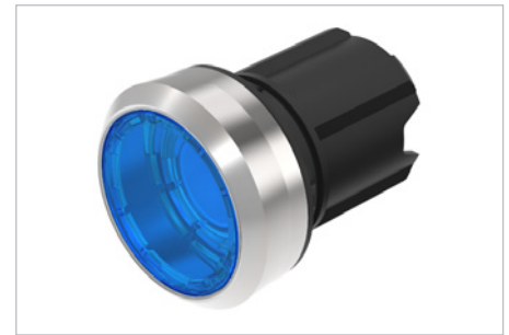
Product can differ from the current configuration.