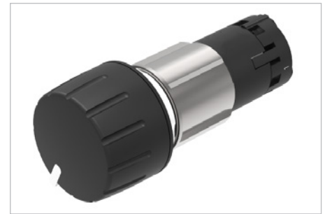
Product can differ from the current configuration.

Each Part Number listed below includes all the black components shown in the 3D-drawing.