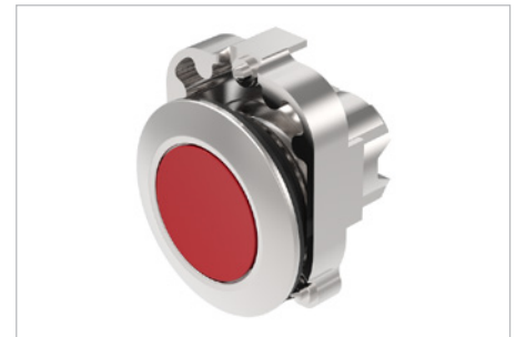
Product can differ from the current configuration.