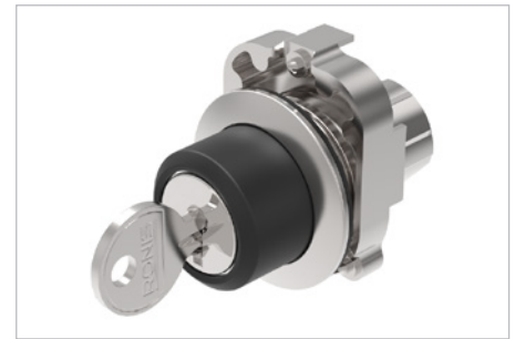
Product can differ from the current configuration.