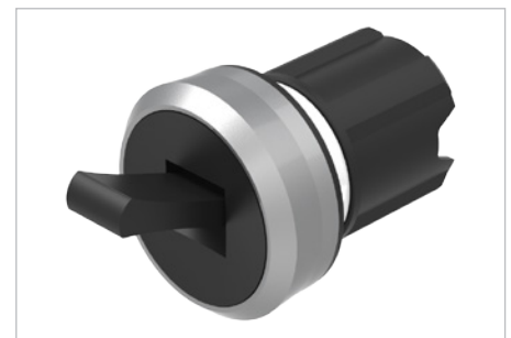
Product can differ from the current configuration.