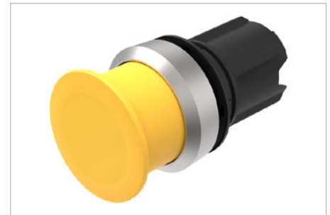
Product can differ from the current configuration.