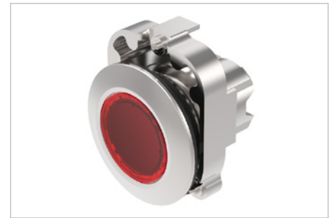
Product can differ from the current configuration.