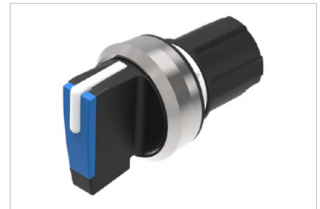
Product can differ from the current configuration.