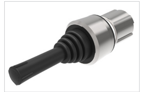
Product can differ from the current configuration.