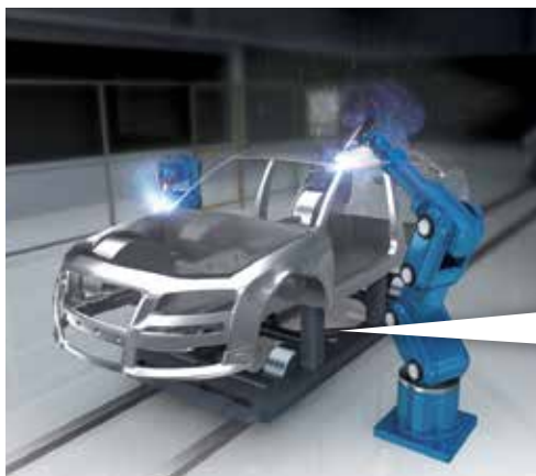
Metal plate position confirmation