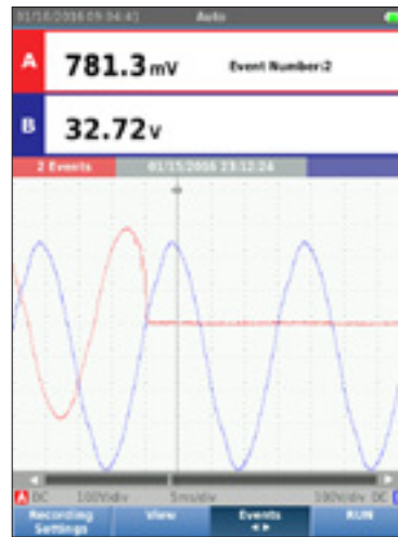
Quickly step through recorded events to identify and troubleshoot intermittent faults.