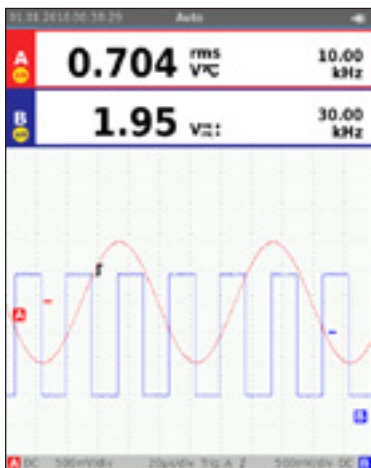
Fluke Connect-and-View™ triggering with Auto Reading function using Fluke IntellaSet™ technology gives you quick access to the data you need.

*Not all models are available in all countries. Check with your local Fluke representative.