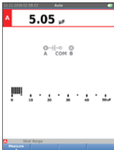
A single test tool measures volts, ohms, amps or capacitance, in addition to displaying waveforms.

Harmonics are periodic distortions of voltage, current, or power sine waves. Harmonics in power distribution systems are often caused by non-linear loads such as switched mode dc power supplies and adjustable speed motor drives. Harmonics can cause transformers, conductors, and motors to overheat. In the Harmonics function, the Test Tool measures harmonics to the 51st. Related data such as dc components, THD (Total Harmonic Distortion), and K factor are measured to provide a complete insight in to the electrical state of health of your loads.