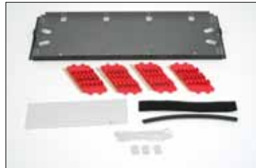
3M™ Fiber Optic Splice Tray 2527