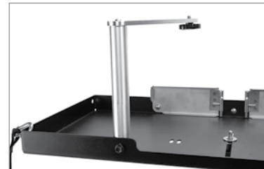
3M™ SLiC™ Fiber Splicing Workstation Cleaver Arm

3M, SLiC and Scotchlok are trademarks of 3M Company.