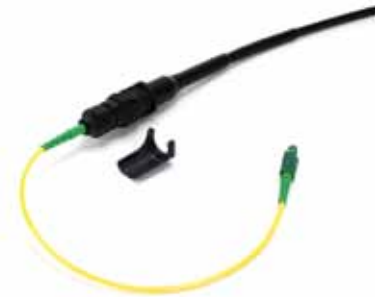
3M™ External Cable Assembly Module (ECAM) FD Factory-Terminated Fiber Drop