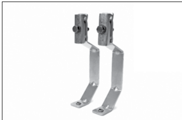
3M™ Offset Hanger Bracket AC-HB4