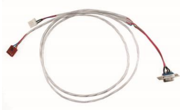
Figure 4: Communication/Power Cable (SCCPC5V)

The most common cable choice for any alphanumeric Matrix Orbital Display, the Communication/ Power Cable offers a simple connection to the unit with familiar interfaces. DB9 and floppy power headers provide all necessary input to drive your display.