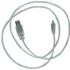
Figure 6: External Mini USB Cable (EXTMUSB3FT)

The External Mini USB cable is recommended for the OK162-12-USB display. It will connect to the miniB style header on the unit and provide a connection to a regular A style USB connector, commonly found on a PC.