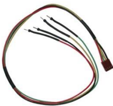
Figure 5: Breadboard Cable (BBC)

The most common cable choice for any alphanumeric Matrix Orbital Display, the Communication/ Power Cable offers a simple connection to the unit with familiar interfaces. DB9 and floppy power headers provide all necessary input to drive your display.