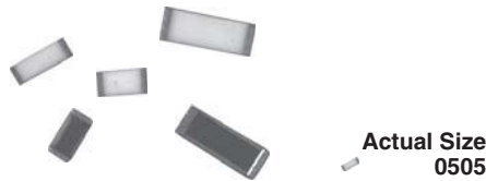
Actual Size 0505

For applications requiring low noise, stability, low temperature coefficient of resistance, and low voltage coefficient, all Vishay's proven precision thin film wraparound resistors will meet your exact requirements. Manufactured with the same material and processes as QPL and manufactured in a QPL facility.