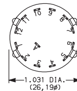
TERM. NOS. MOLDED ON HOUSING