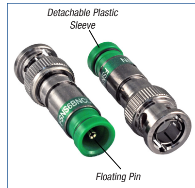
FSNS6BNCU ProSNS™ Universal BNC Series 6 Connector

Like our 59 and 6 connectors, the ProSNS™ RG-11 F connectors utilize a plastic pin guide for greater connector performance and easy installation.