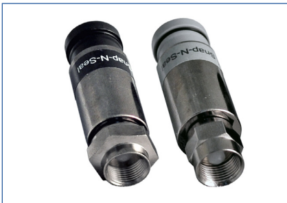
SNS1P11H and 716SNS1P11HPLA ProSNS™ Universal RG-11 Connectors